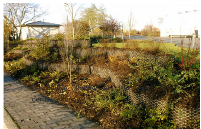
The BRISTA Ökowall one year after the creation.